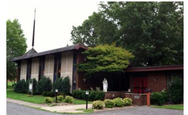
721 Hall Street Bridgeport