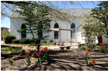
Sixth and Main Streets Clarksburg