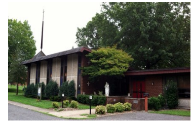
721 Hall Street Bridgeport

Holy Week is the most important week of the entire year for Christians around the world. It begins with Jesus' triumphal entry into Jerusalem on Palm Sunday, in which we see a peculiar power manifested in humility. It continues with Jesus' loving provision for his closest friends, as he gathers them on Maundy Thursday for a sacred meal that would sustain and give life to them in his absence, and he shows them the way of true greatness in service.