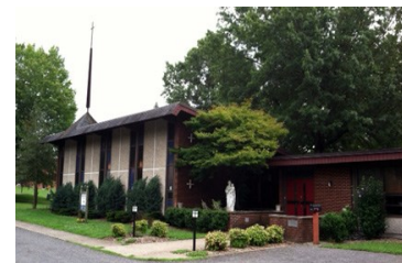
721 Hall Street Bridgeport

Holy Week is the most important week of the entire year for Christians around the world. It begins with Jesus' triumphal entry into Jerusalem on Palm Sunday, in which we see a peculiar power manifested in humility. It continues with Jesus' loving provision for his closest friends, as he gathers them on Maundy Thursday for a sacred meal that would sustain and give life to them in his absence, and he shows them the way of true greatness in service.