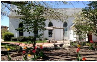
Sixth and Main Streets Clarksburg