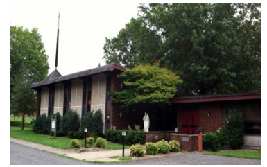
721 Hall Street Bridgeport