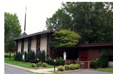
721 Hall Street Bridgeport