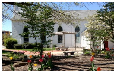
Sixth and Main Streets Clarksburg