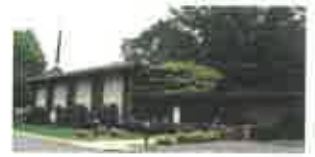
St. Barnabas Chapel (SBC) 721 Hall Street Bridgeport, WV

Office phone: 304-622-3694 Website: www.christchurchclarksburg.com Facebook: https://www.facebook.com/Episcopalparishinclarksburg/ Email address: christchurch1853 WV Diocese Website: www.wvdiocese.org ... our mission is to know, live, and share the Good News Story of Jesus Christ.