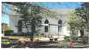
Christ Church (CEC) Main and Sixth Streets Clarksburg, WV