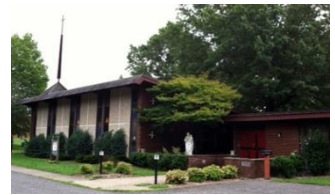
St. Barnabas Chapel 721 Hall Street Bridgeport, WV

... to know, live, and share the Good News Story of Jesus Christ