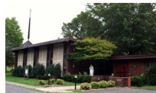
St. Barnabas Chapel 721 Hall Street Bridgeport, WV