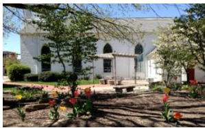
Christ Church Sixth and Main Streets Clarksburg, WV